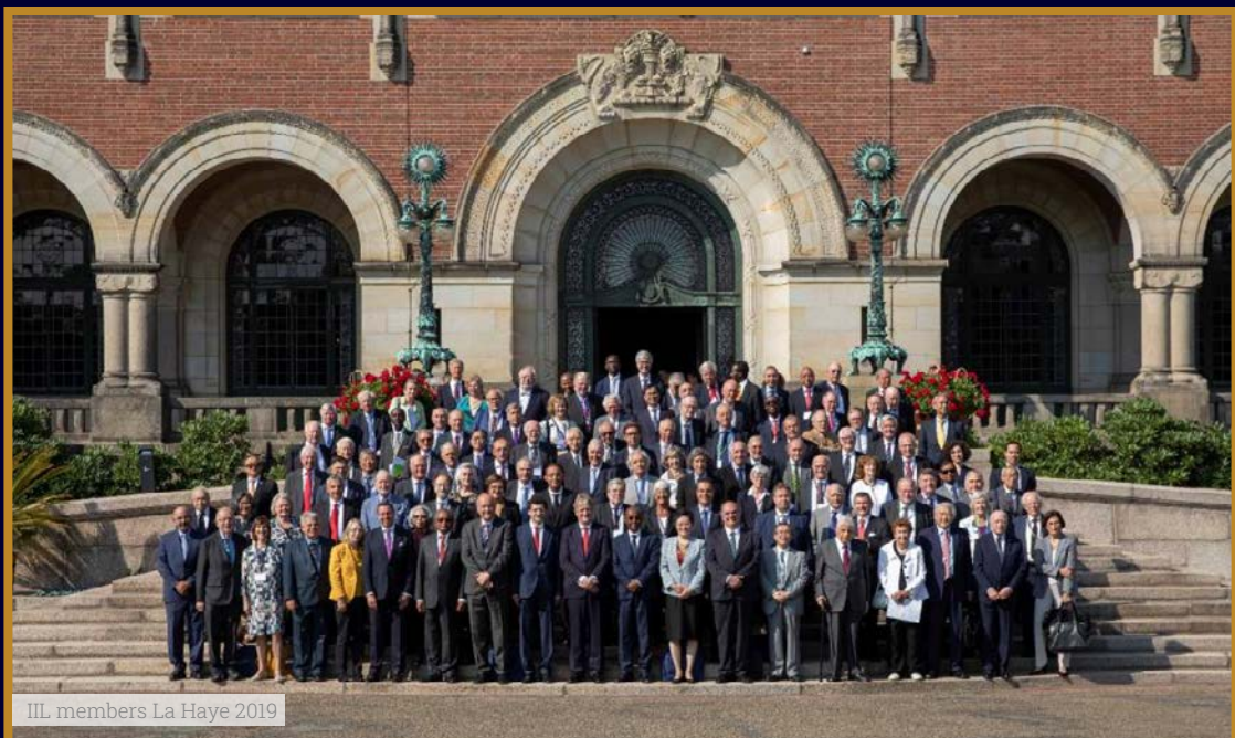
IIIL members La Haye 2019

Angers Session 27 AUGUST - 3 SEPTEMBER 2023