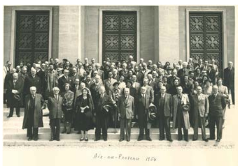
IIL members, Aix-en-Provence 1954

The Institute's mission is to reflect on, debate and adopt texts on topical issues of international law, which are intended to inspire the practice of international law 3 . At its last session in 2021 (organised exceptionally online), the Institute adopted resolutions on :