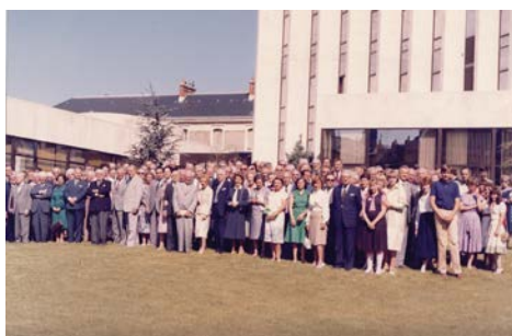
IIL members, Strasbourg 1997