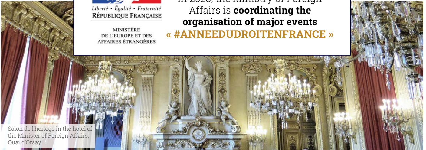
Salon de l'horloge in the hotel of the Minister of Foreign Affairs, Quai d'Orsay